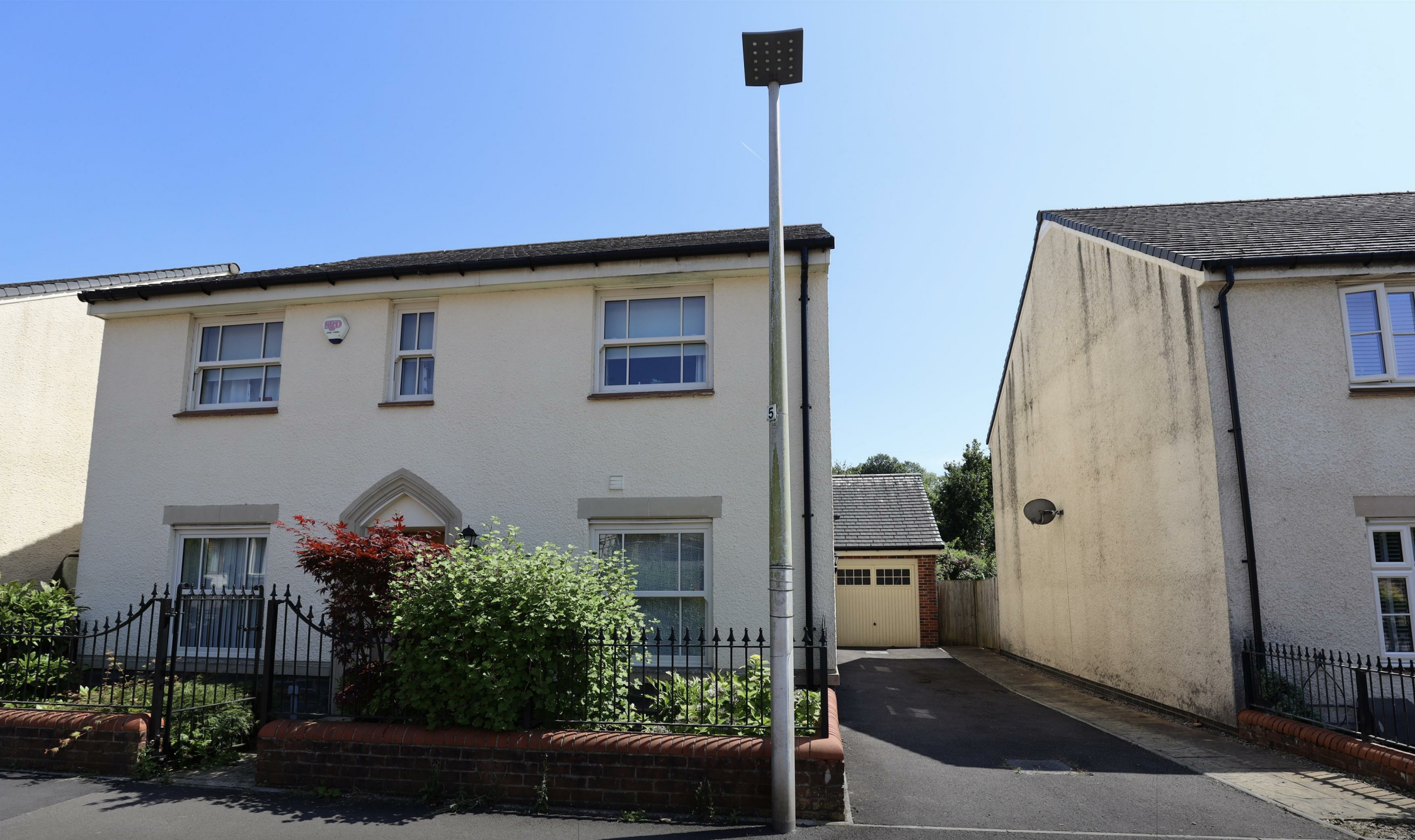
Hoggan House, Townmill Road Cowbridge, CF71 7BE